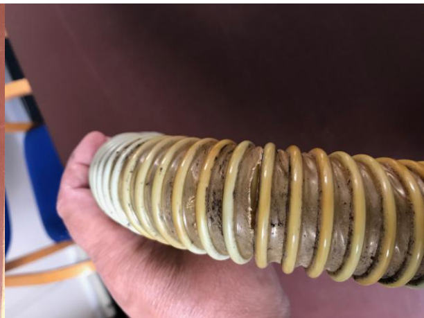
Typical hose split