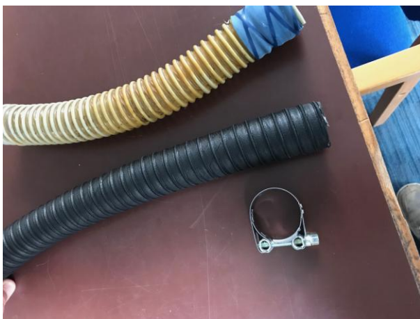
New hose (bottom) and new hose clamp