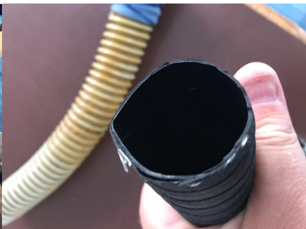
New smooth bore